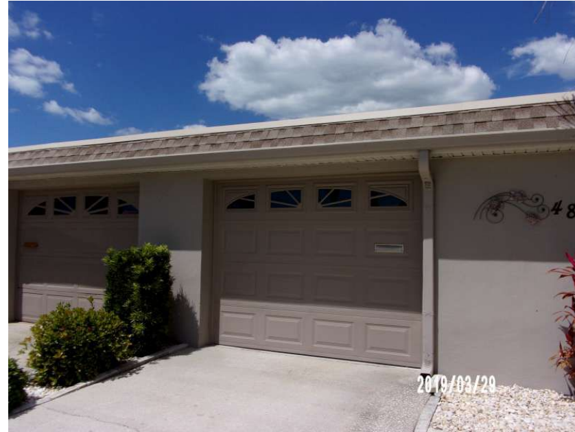
Unprotected Glazed Garage Door