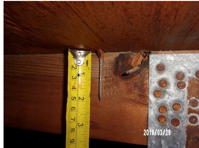
8d Nails or Greater in Size