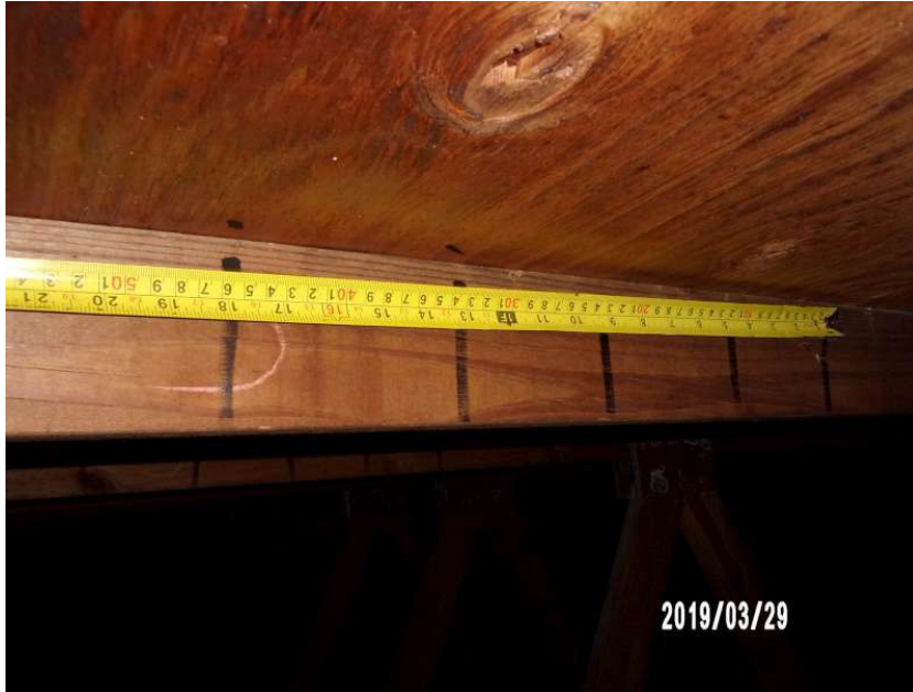
8d Nails or Greater in Size Spaced 6" Along the Edge