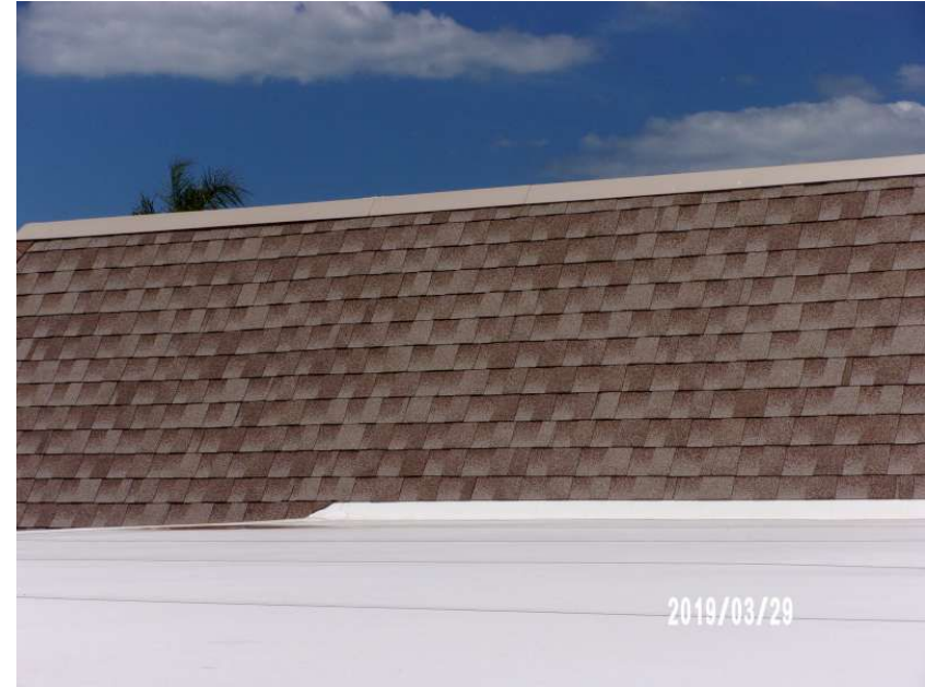
Architectural/Dimensional Shingle Roof Covering