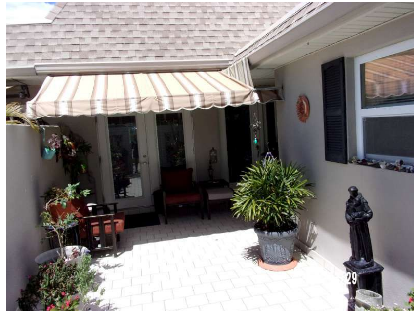
Unprotected Glazed Entry Door/Window