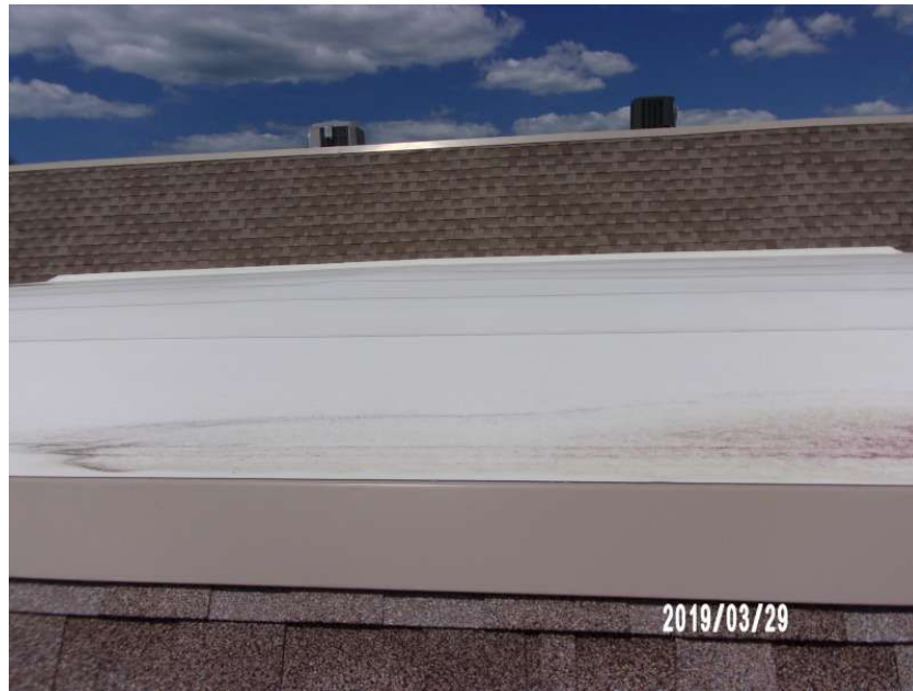
Membrane Roof Covering