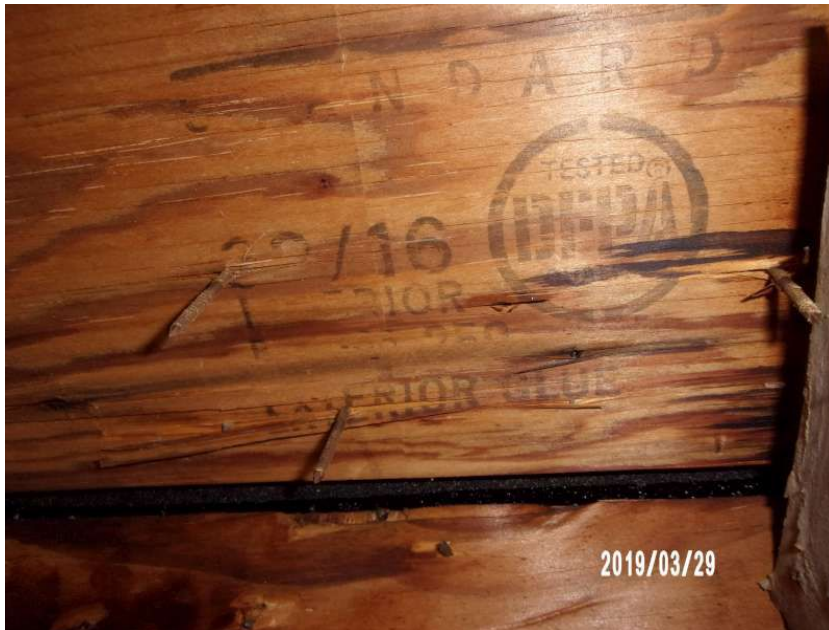
1/2" Deck Thickness Confirmed