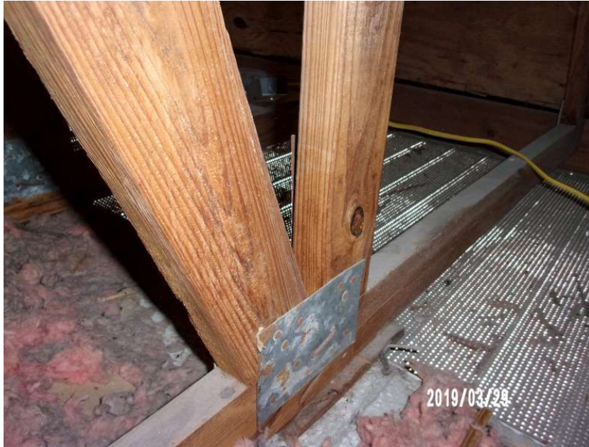
Metal Connector with 2 Nails on the Front Side & 0 Nails on the Opposing Side