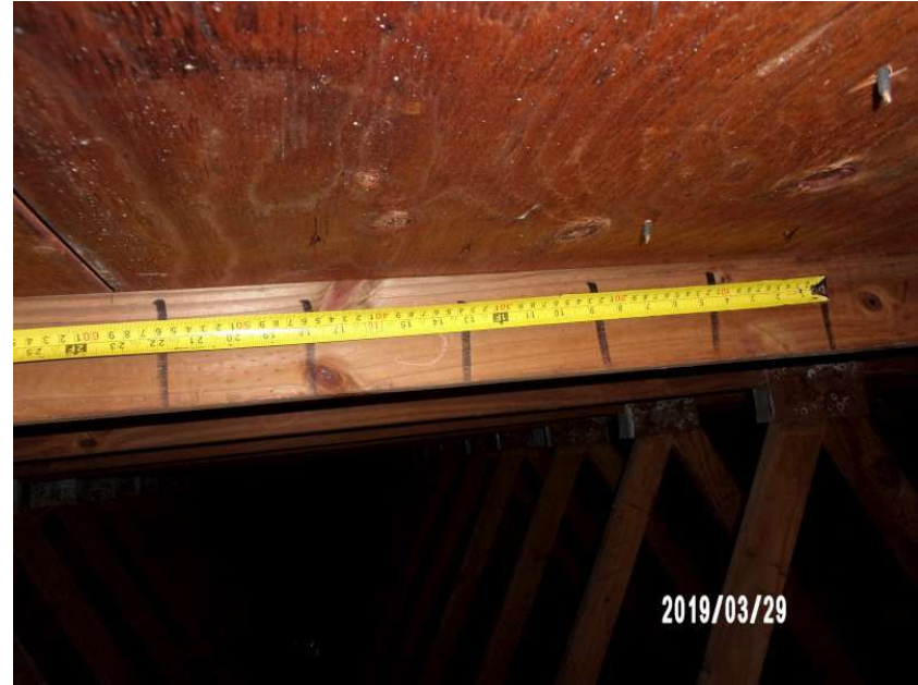
8d Nails or Greater in Size Spaced 6" in the Field