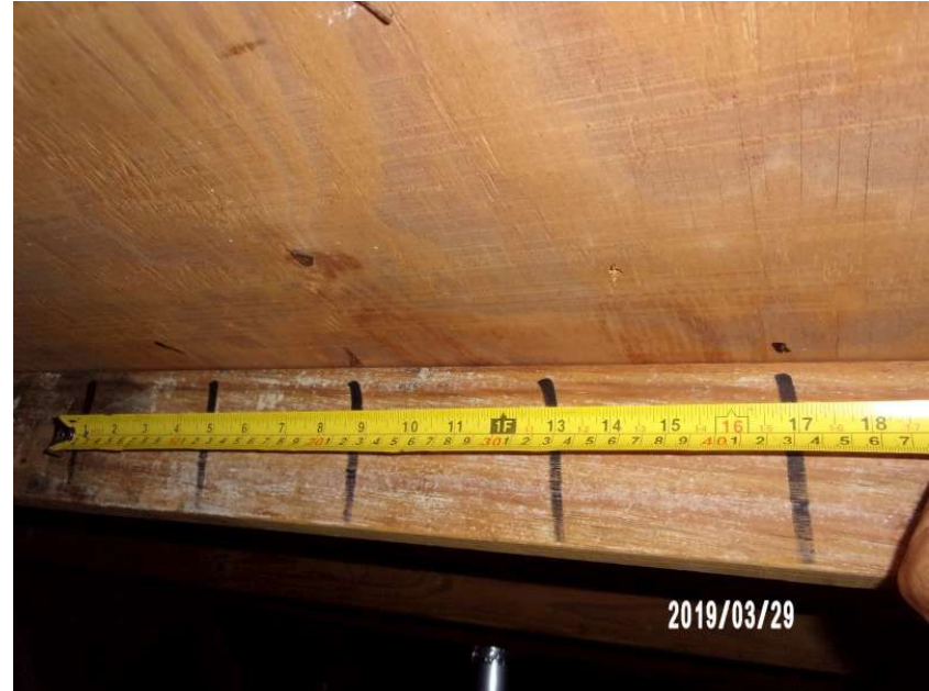
8d Nails or Greater in Size Spaced 6" in the Field