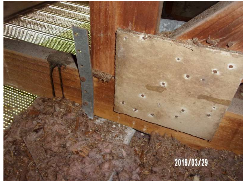
Metal Connector with 2 Nails on the Front Side & 0 Nails on the Opposing Side