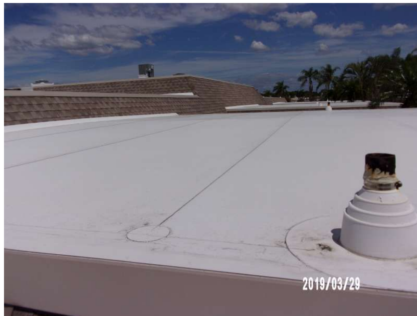
Membrane Roof Covering