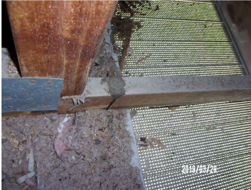
Metal Connector with 2 Nails on the Front Side & 0 Nails on the Opposing Side