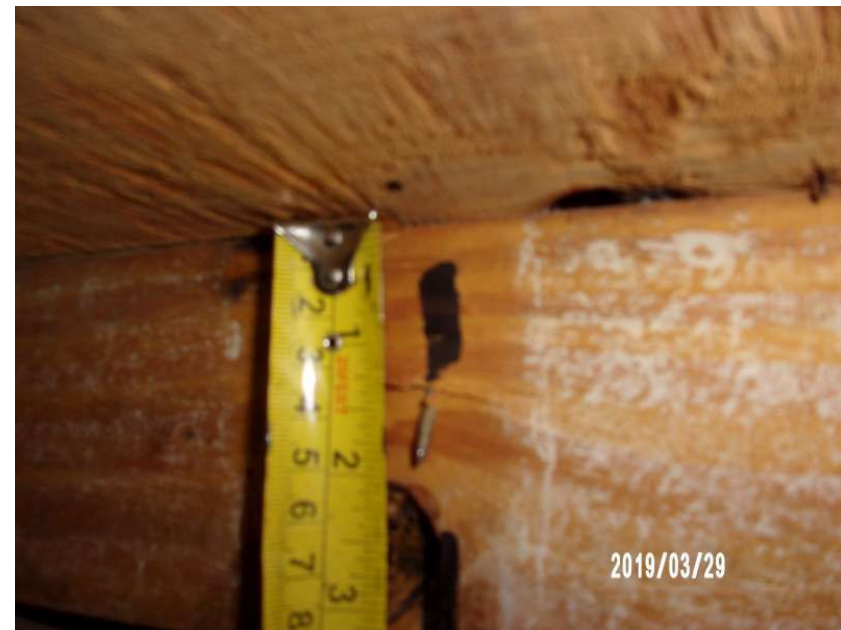
8d Nails or Greater in Size