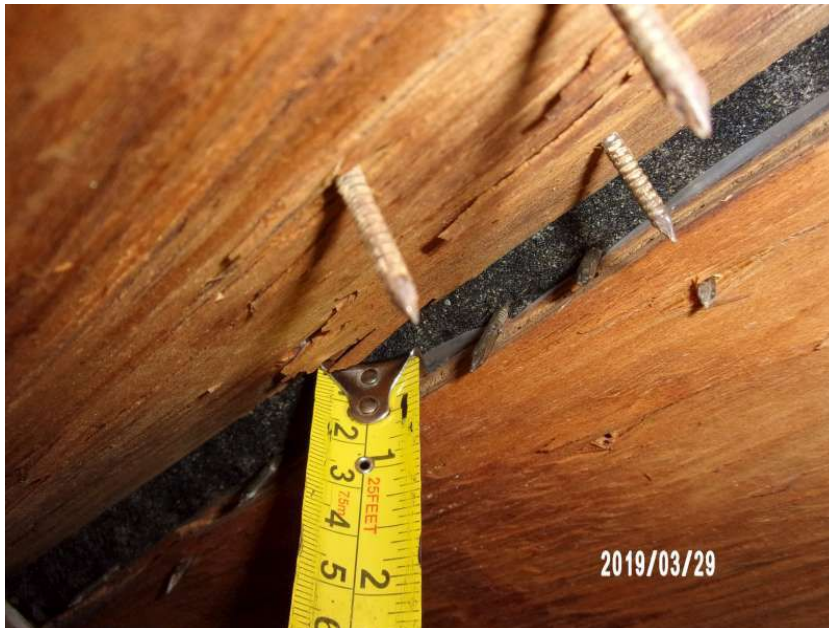
1/2" Deck Thickness Confirmed