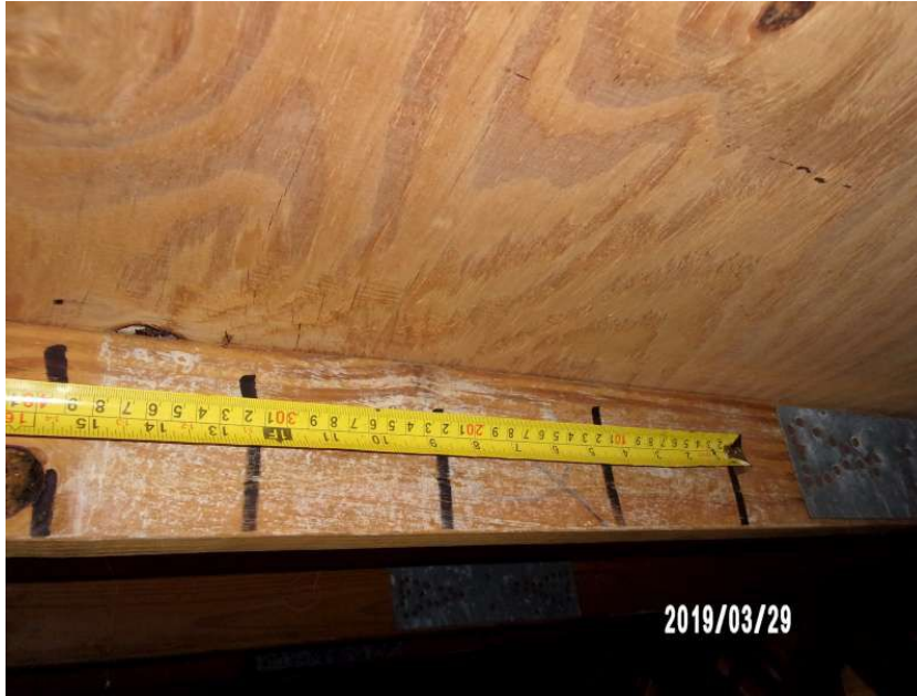
8d Nails or Greater in Size Spaced 6" Along the Edge