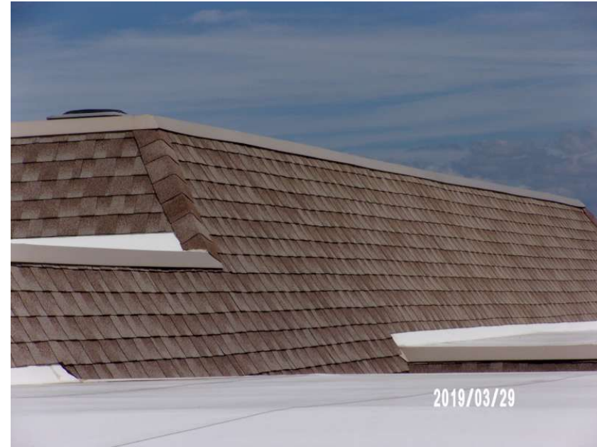
Architectural/Dimensional Shingle Roof Covering