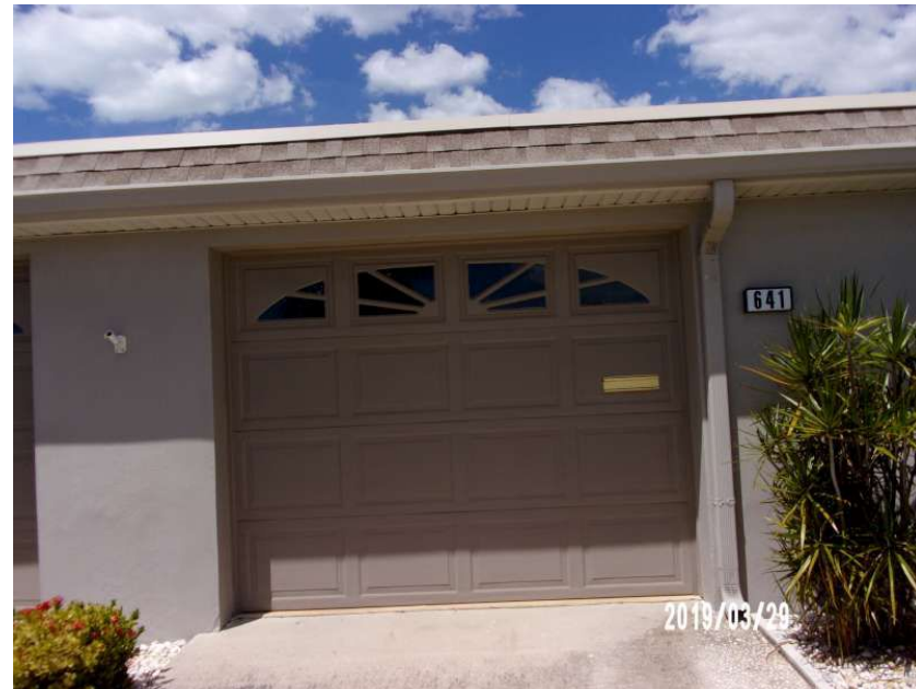
Unprotected Glazed Garage Door